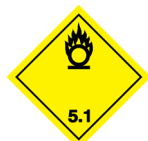
Class 5.1 HAZARD Oxidizing Substances

ADR , Annex A General provisions and provisions concerning dangerous substances and articles; Classification; Class Specific Provisions